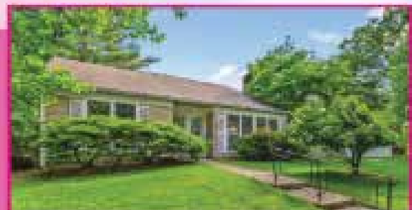
LEISURE VILLAGE WEST 1602 sq ft Hasting Model