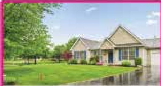
3 Deerchase Lane

Hire a Fairways Resident who has your best interest at heart, goes over and above, from start to end; and has been working as a team player for many years with all the wonderful Realtors working in Fairways.